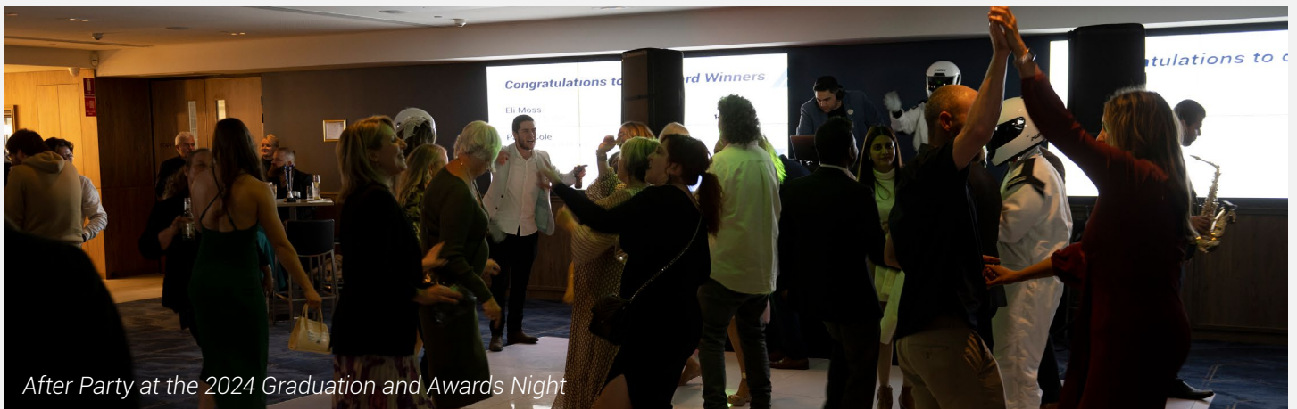
After Party at the 2024 Graduation and Awards Night