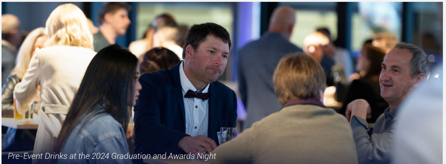
Pre-Event Drinks at the 2024 Graduation and Awards Night